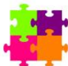
a jigsaw puzzle