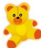
a teddy bear